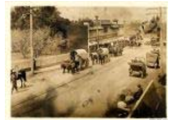
Big Basin Way, 1912.