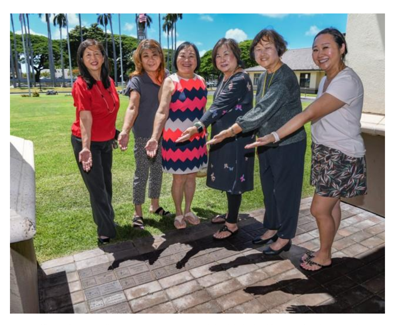
Officers of the Hawaii Chapter gesture toward the brick laid in the driveway of Shriners Hospital with OCAW Hawaii's name engraved.

Today, Shriners Children Hawaii continues to provide care, still regardless of ability to pay or insurance status.