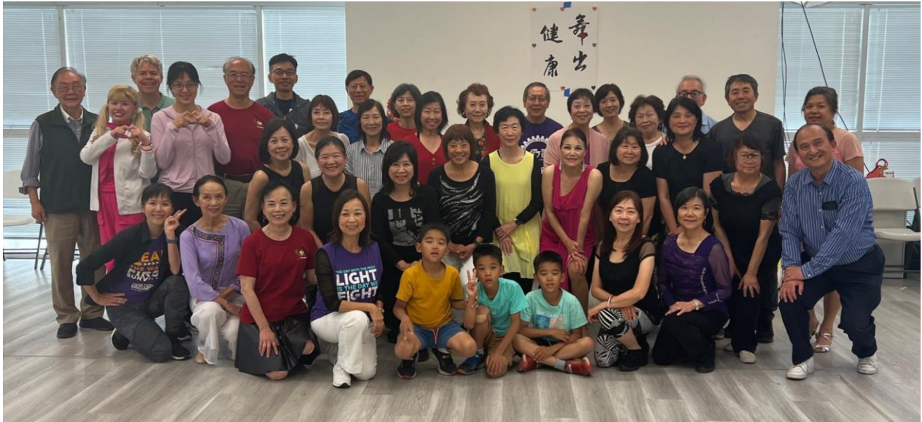
Two happy groups of dancers!

With generous contributions from people who attended the June 1st event or not, Aichu was able to achieve a total amount of donations exceeding $16,000. Their support for the Alzheimer's Association was very much appreciated. The funds will be used to provide numerous free services and educational programs for the community as well as important research projects.