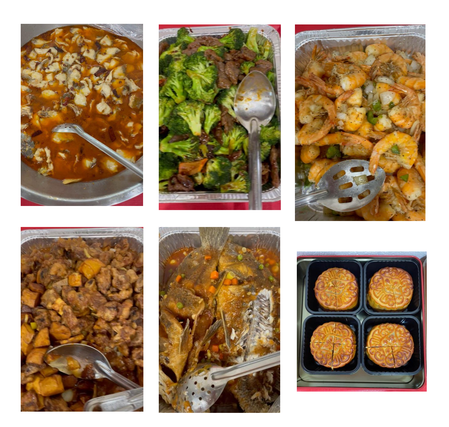
Dr. Lily Qinli Wu assisted with the lunch details and presenting a video that taught about the Mid-Autumn celebration, and Lily Yang sang a beautiful song in Chinese highlighting this wonderful time in China. Following are the lyrics:

The menu included special Chingqing style dishes (not too spicy since most members cannot eat extra spicy) which were hot boiled fish with cabbage, beef and broccoli, salt and pepper large shrimp, sweet and sour pork ribs, and sweet and sour whole fish, along with traditional moon cakes for dessert.