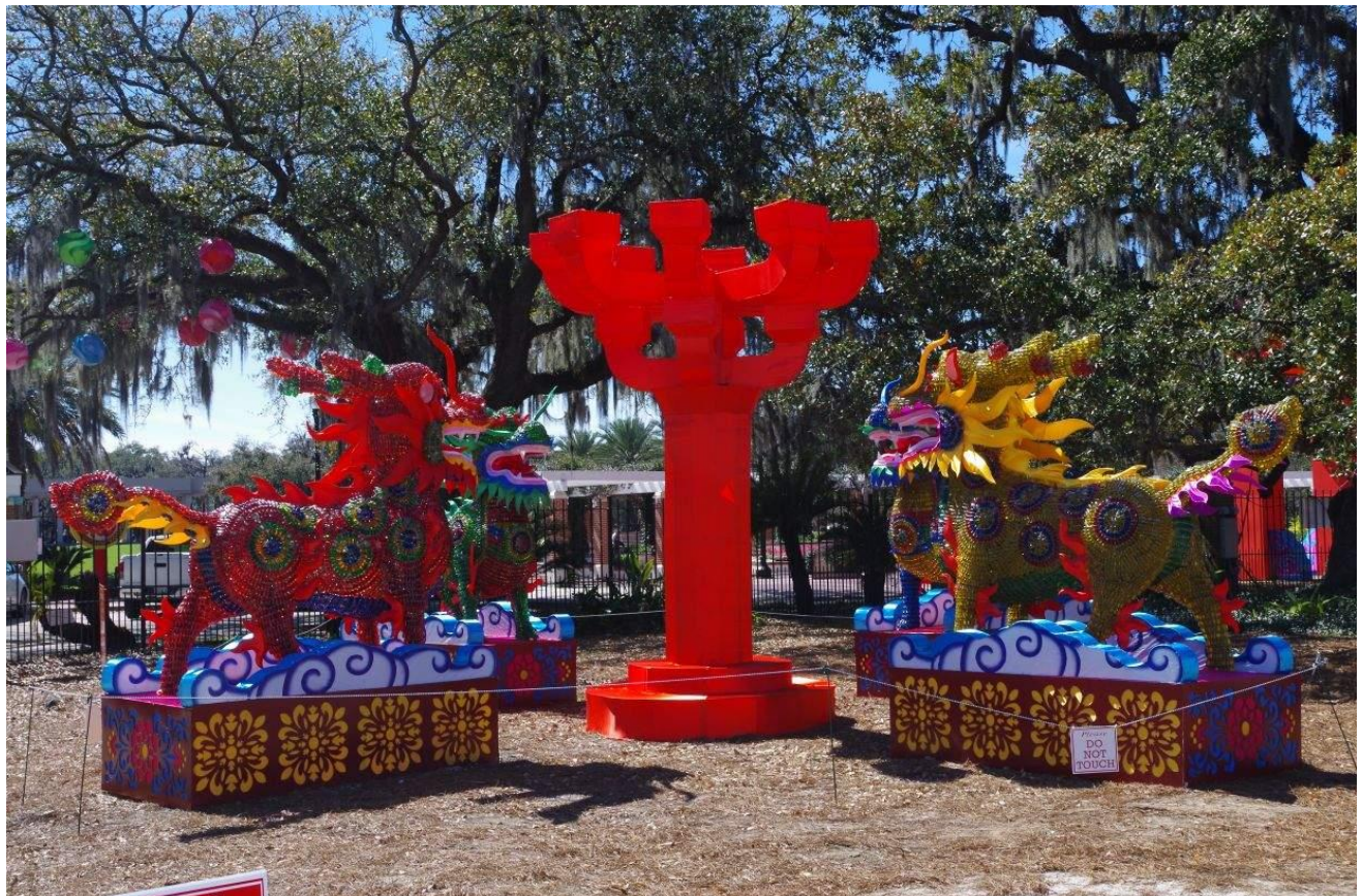
Qilins / Chimeras

In the China Lights exhibit, the flock of cranes is set in a small Japanese garden, although it is cordoned off to visitors.