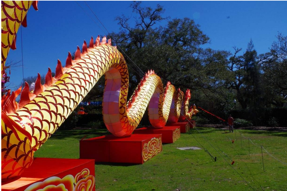
This dragon lantern sculpture is 130 feet long.

No animal embodies the spirit of the Chinese people or represents China's national unity more than the dragon, which is a symbol of dignity, strength, and power. This auspicious creature – believed to be a descendant of the Chinese people – is a national icon linked with powers over the natural world (particularly water, rainfall, hurricanes, and floods), and bestows fortune, longevity, strength, and endurance. The dragon appears in a variety of colors – blue, black, white, and red – but a yellow dragon is the most revered of all.