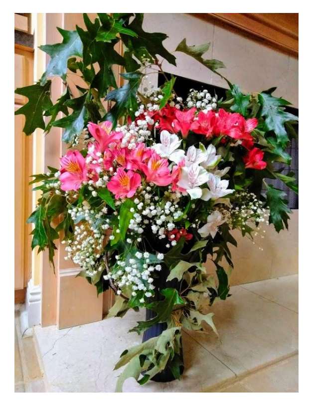
This arrangement is entitled "A tall tree catches the wind."