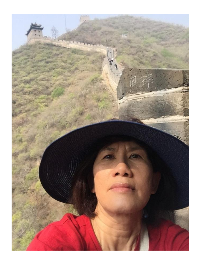
(Editor's Note: Chi-Hua plans to write Part II for the next issue.)