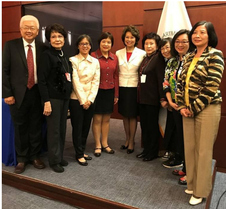
U.S. Secretary of Transportation Elaine Chao in center