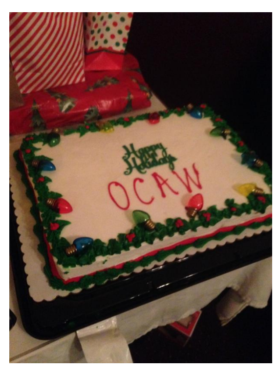
Our Christmas cake