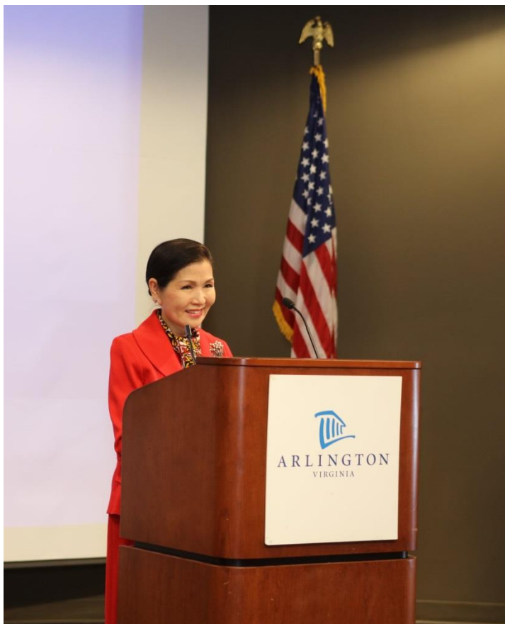
Yumi Hogan, First Lady of Maryland

The special guest of honor was Yumi Hogan, the First Lady of Maryland. Ms. Hogan is an accomplished artist and is the first Korean-American First Lady in the United States. Following some remarks by the First Lady, OCAW was presented with an official proclamation from The Honorable Larry Hogan, Governor of Maryland, declaring January 28, 2017 as Asian Lunar New Year Day in Maryland.