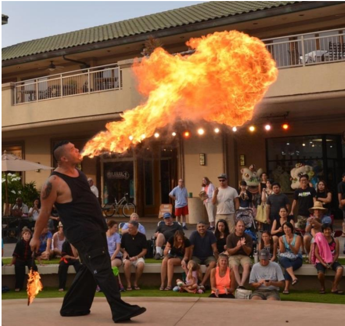
The audience was enthralled with the fire-breathing “Dragon.”