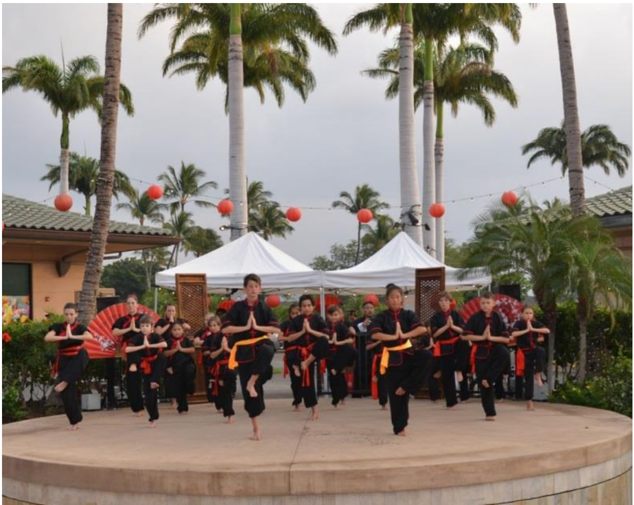
Youngsters perform martial arts movements to modern music.