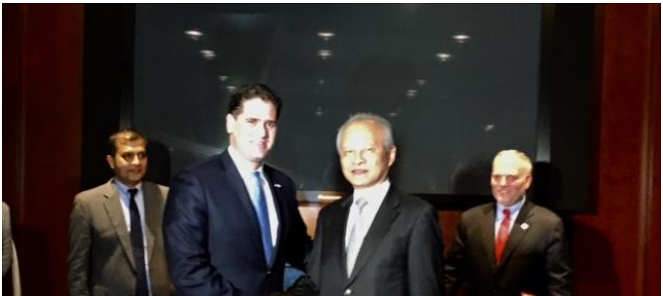
His Excellency Ron Dermer, Ambassador of Israel to the United States, and His Excellency Cui Tiankai, Ambassador of the People's Republic of China to the United States

friendship of both countries. Ambassador Dermer expressed the strength of the Israeli-Chinese relationship during a difficult era in history, with heartfelt gratitude on behalf of the Jewish people to the Chinese for its open door to accept more than 25,000 refugees from the Holocaust in Europe to Shanghai. Dermer talked about the Chinese Ambassador Ho Feng-Shan (Republic of China) to Berlin at the time, who witnessed the increasing Nazi brutality after the 1938 Kristallnacht blood-drenched rampage which destroyed and burned thousands of synagogues and Jewish-owned businesses, and who began issuing visas to the Jewish people to Shanghai. From March 1938 to May 1940, Ho Feng-Shan signed nearly 1000 visas a month. When Yad Vashem, the Shoah Martyrs' and Heroes' Remembrance Authority, was established in 1953 by the Israel Knesset, one of its tasks was to commemorate the "Righteous among the Nations." The Righteous were defined as non-Jews who risked their lives to save Jews during the Holocaust. Ho Feng-Shan was given this honored award, "the Righteous among the Nations," for saving over 20,000 Jewish lives.