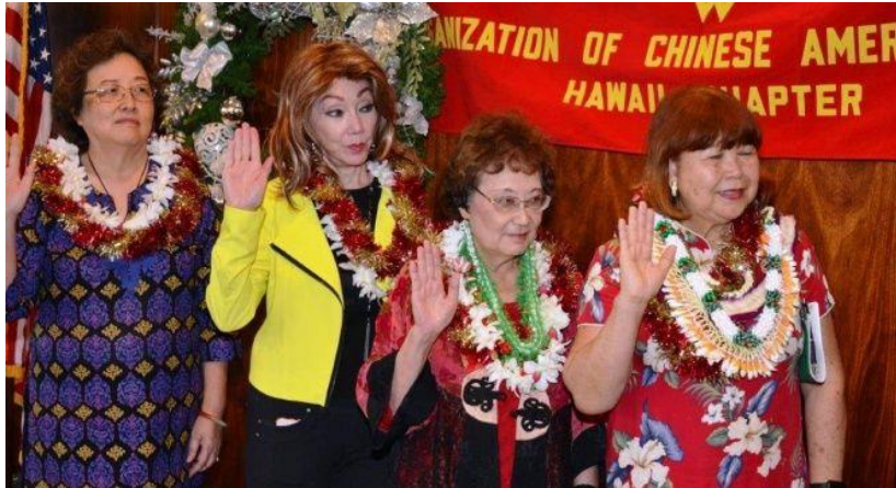
2017 officers installation: taking the oath

We also recognized the past presidents of OCAW-Hawaii who were present at the gala affair.