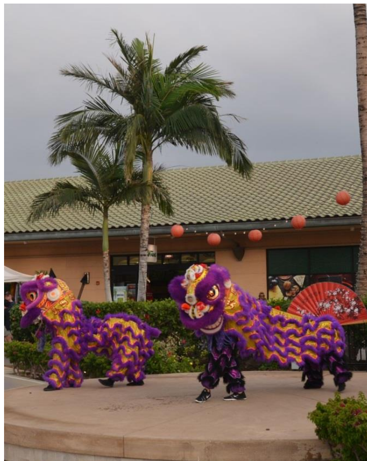
What is Chinese New Year without the lions?