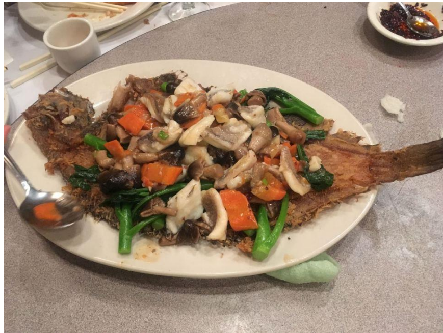
The fish course