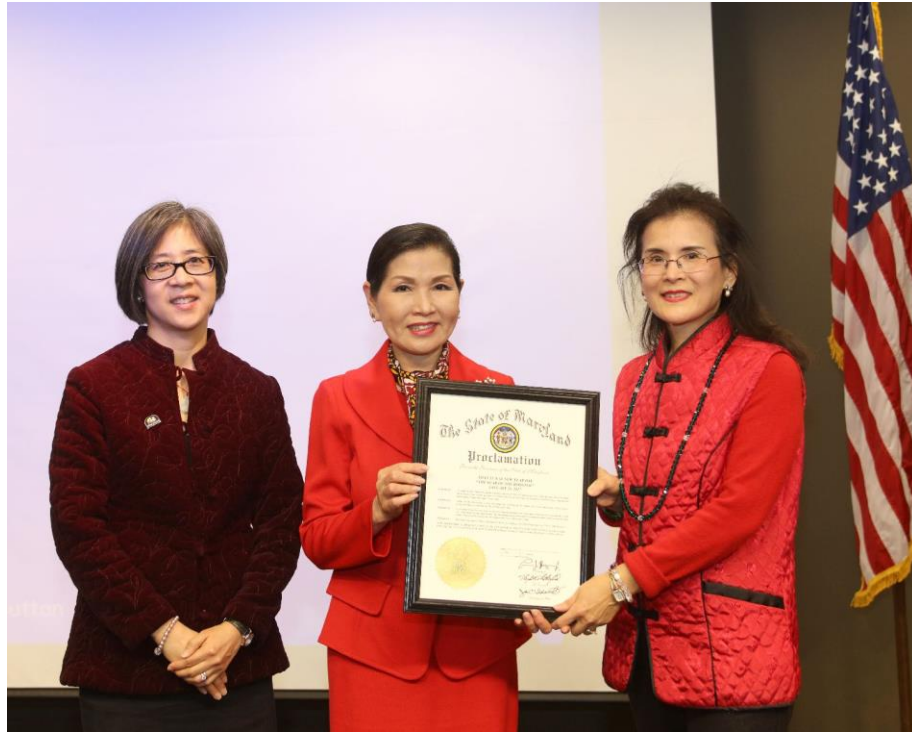
Presentation of Governor of Maryland Larry Hogan's Official Proclamation