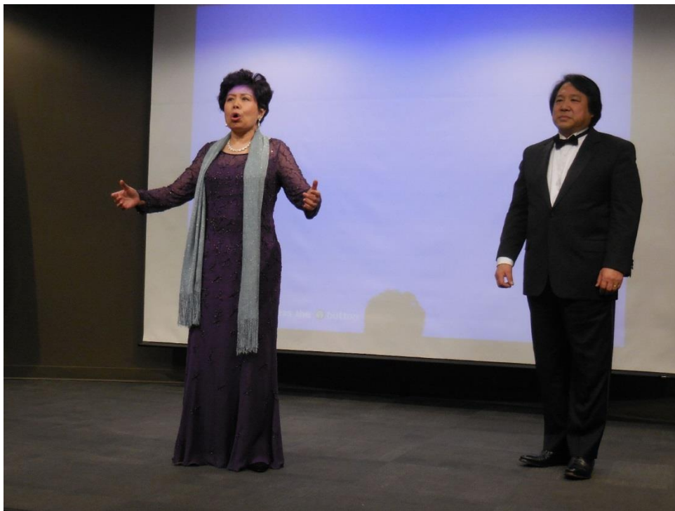
Noted opera singers Hai-bo Bai and Hong-fa Chu