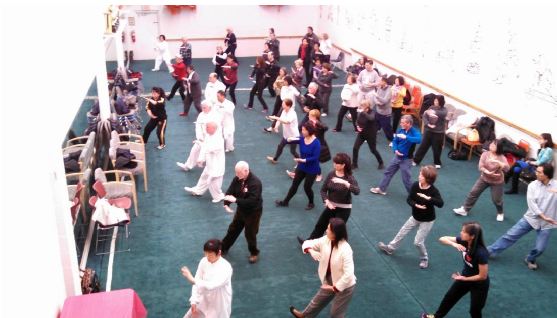
Hold the ball on the left