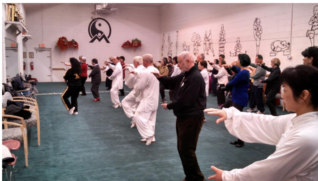
Hold the ball on the right