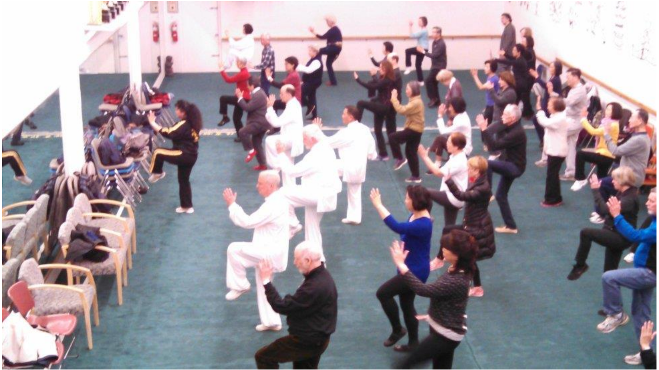
Golden cock stands on one leg