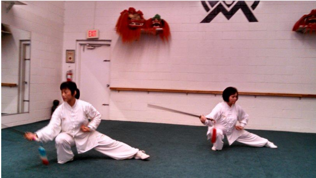
Taiji straight sword demonstration

Taijiquan was derived from the Chinese traditional martial art. It is a safe exercise for people of all ages. In the seminar, students of O-mei Wushu Center's Taiji class performed Taijiquan, Taiji Sword, and the Eight Brocade.