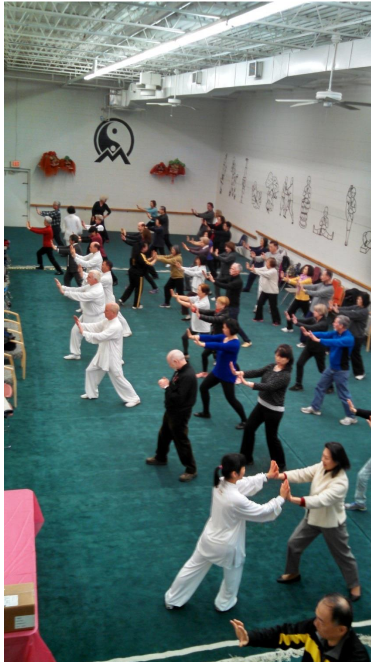
Participants doing the basic Taiji movements

The OCAW Virginia Chapter cosponsored O-mei Wushu Kungfu Center's Taiji Seminar on Sunday, March 15, 2015 in Fairfax, Virginia. Nearly 70 people attended the seminar, including members, family, and friends of OCAW-VA and OCAW-MD. A good mixture of attendees is demonstrated in the accompanying photos which show individuals from different cultures with the same interest in enhancing their health, gathered to learn more about this Chinese traditional art.